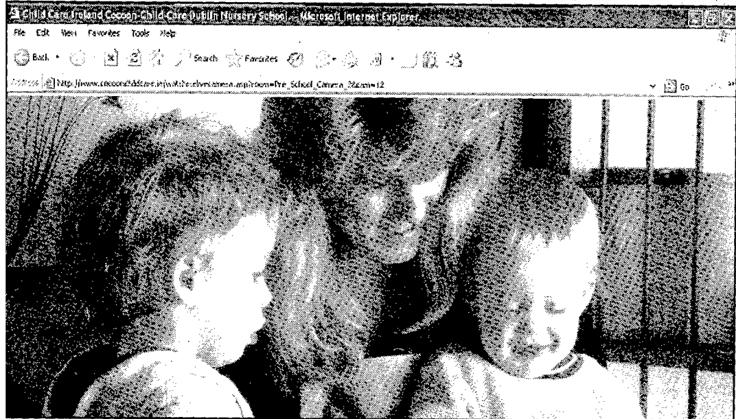
I'M WATCHING YOU: Mums can log on to the internet to see how their children are being looked after